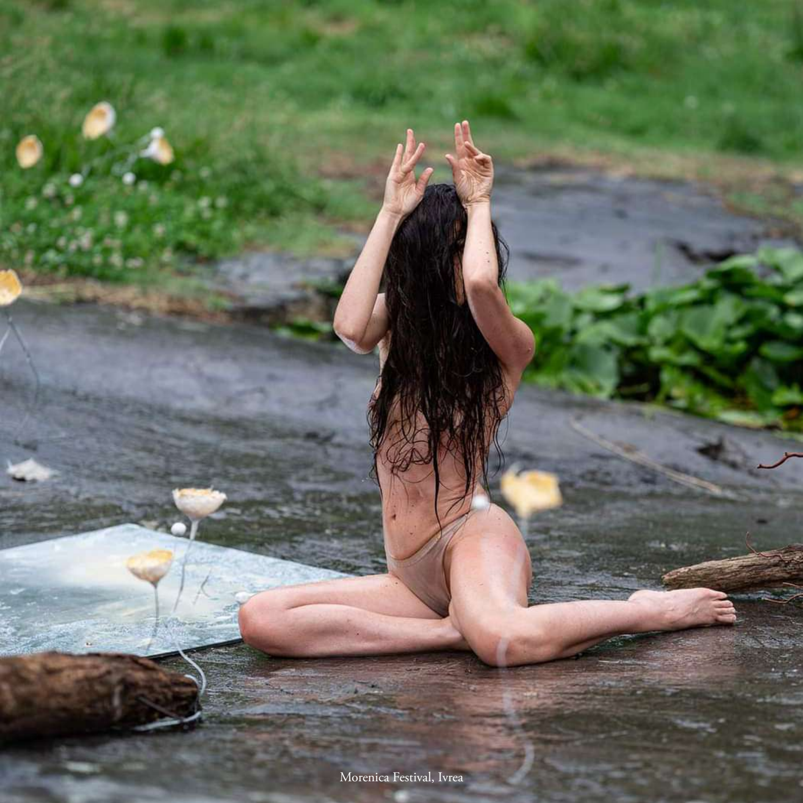
Morenica Festival, Ivrea