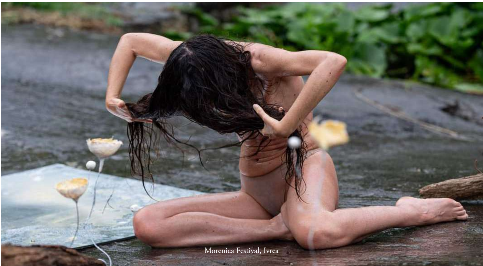
Morenica Festival, Ivrea