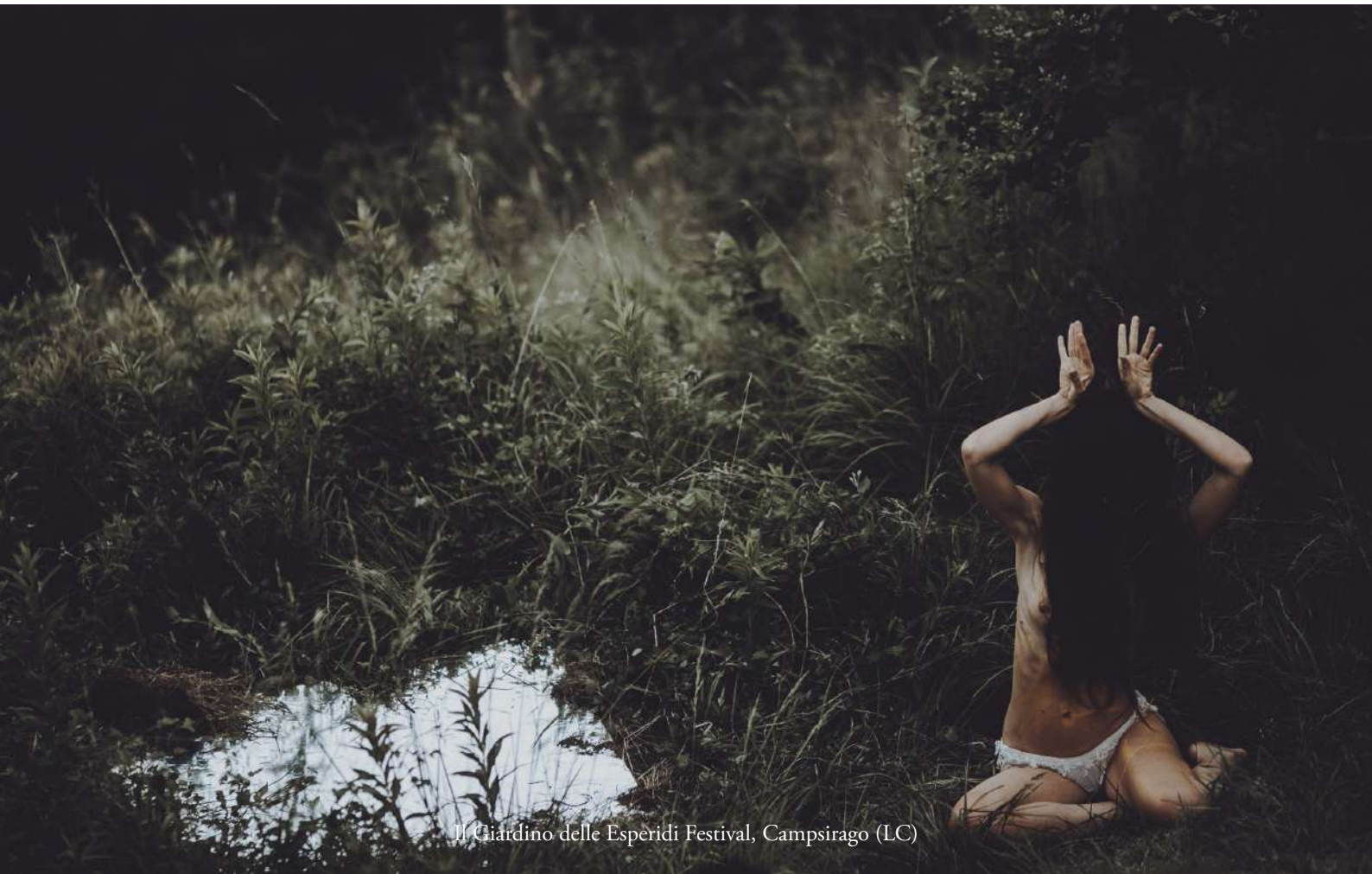
Il Giardino delle Esperidi Festival, Campsirago (LC)